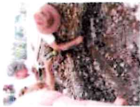
Well Site Excavations, Thurston County