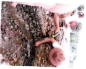
Well Site Excavations, Thurston County