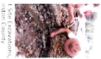
1 Site Excavations, Jackson County