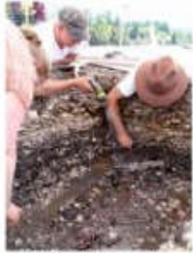
Wet Site Excavations, Thurston County